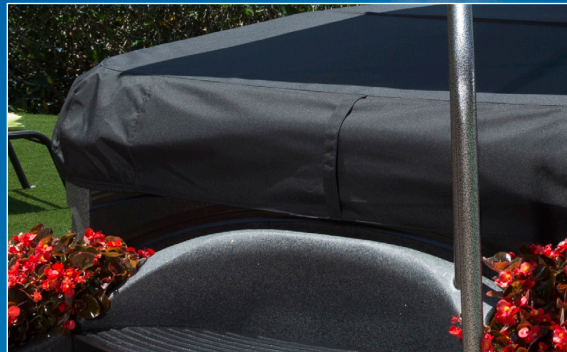
Weather Shield Super Seal Cover material for greater all-weather protection