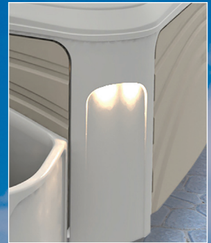
8 Exterior LED corner lights

LED Footwell Light for an underwater glow