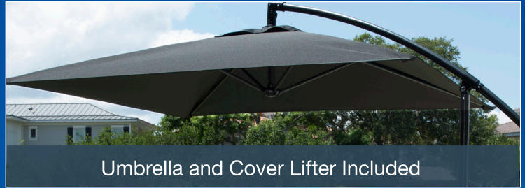
Umbrella and Cover Lifter Included

Integrated Umbrella included, made with Weather Shield material for all-weather protection.