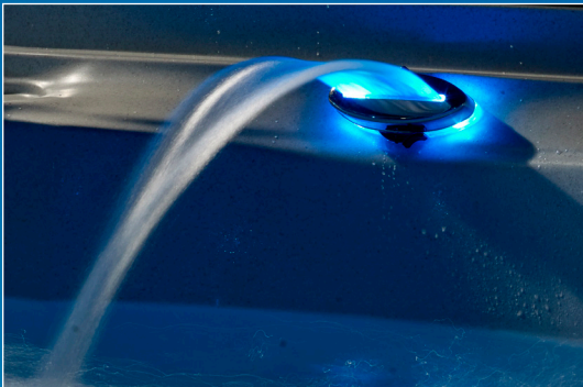
Fountain feature with controllable flow and 9 programmable LED color options