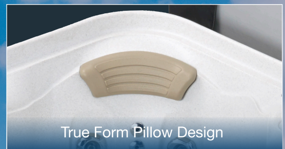
True Form Pillow Design